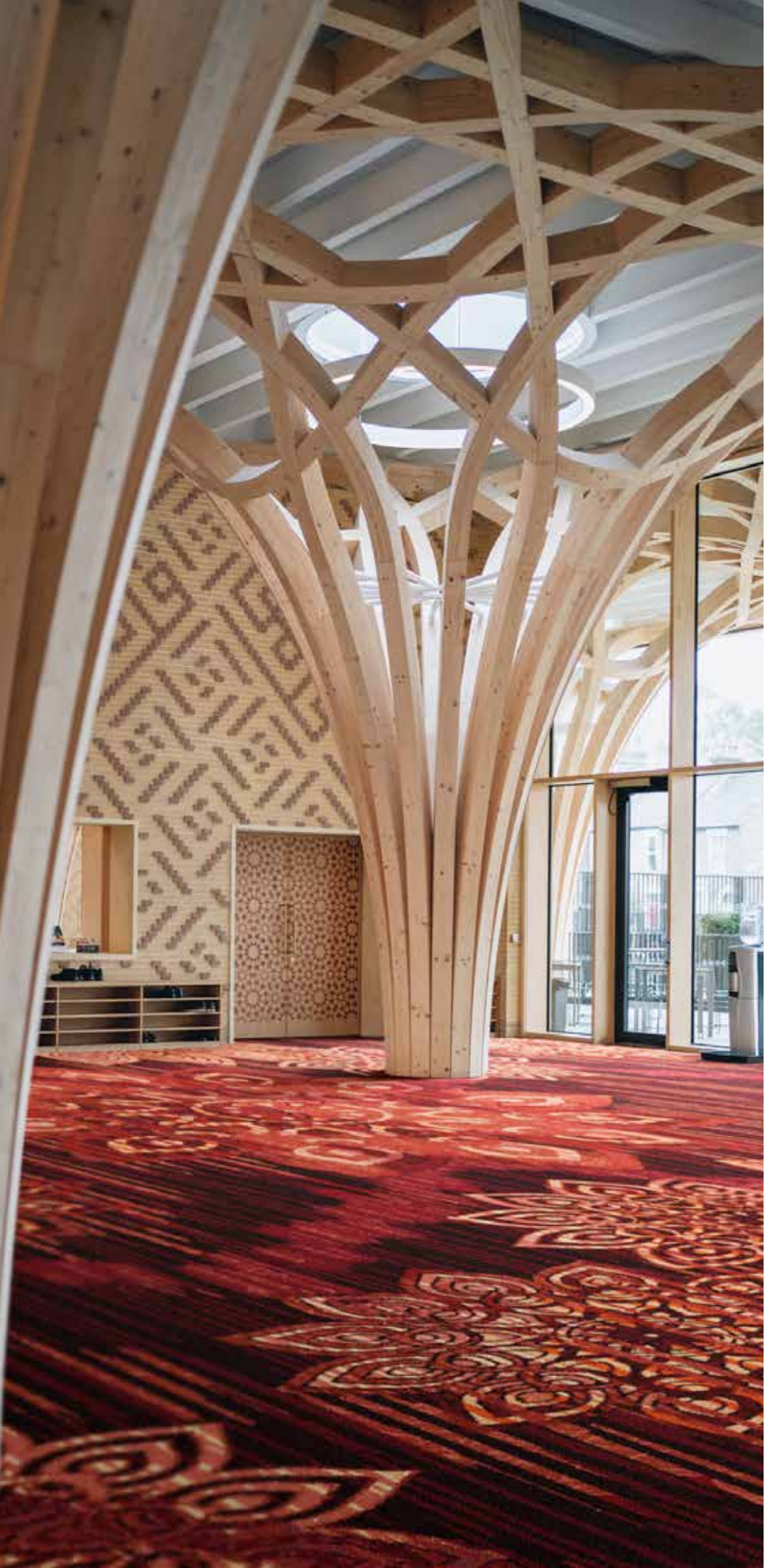
▲ Product Shown: Custom Axminster (AX864-7)