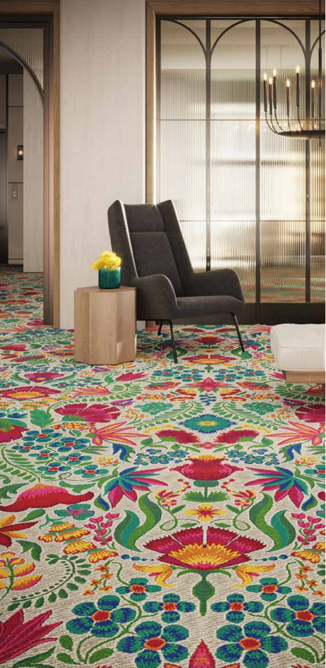
▲ Product Shown: El Alma II