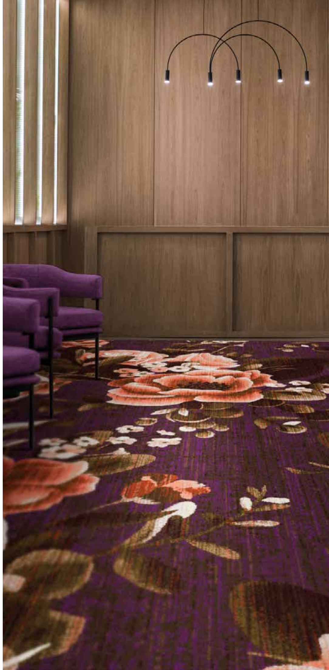
▼ Product Shown: Custom Axminster (AX924-8)