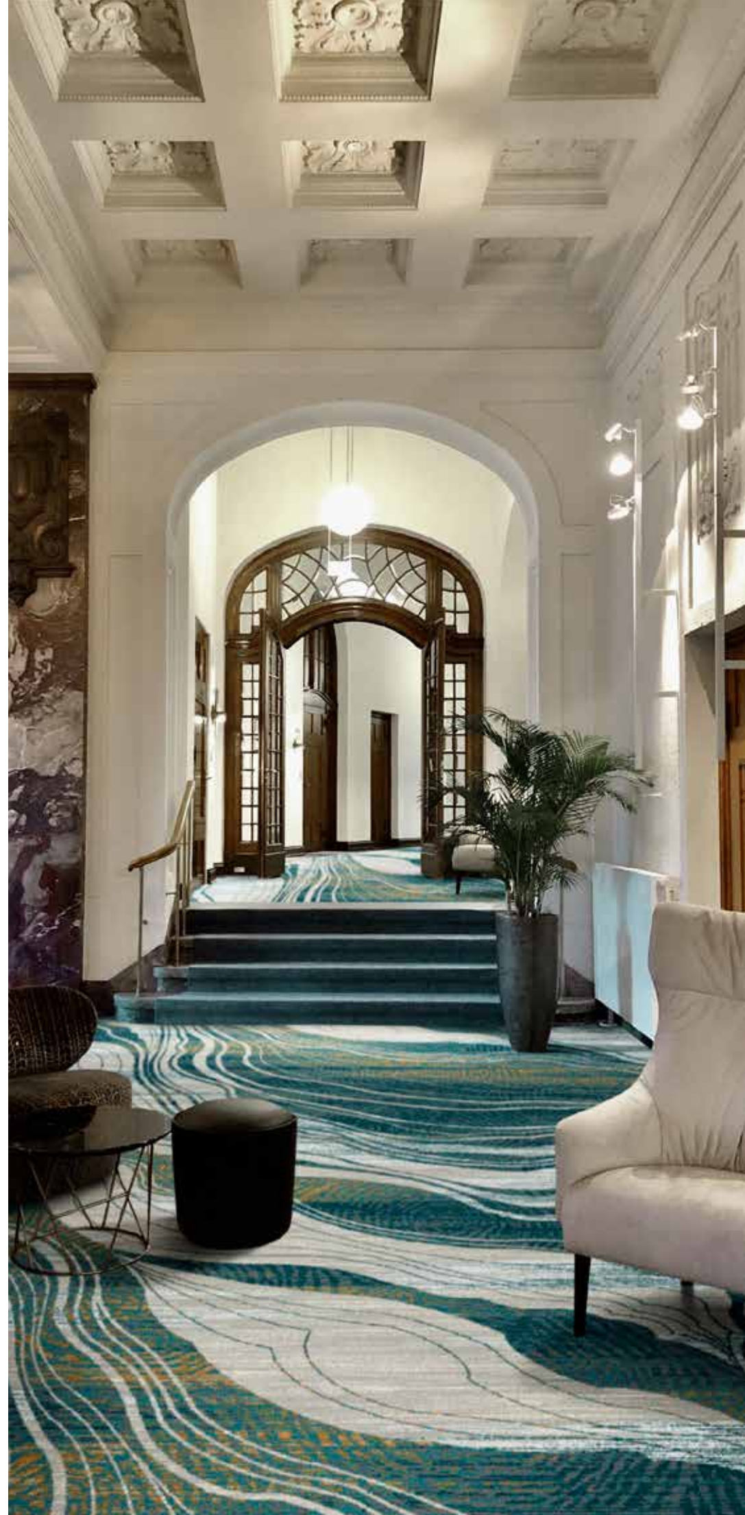
▲ Product Shown: Custom Axminster (AX1177-9)